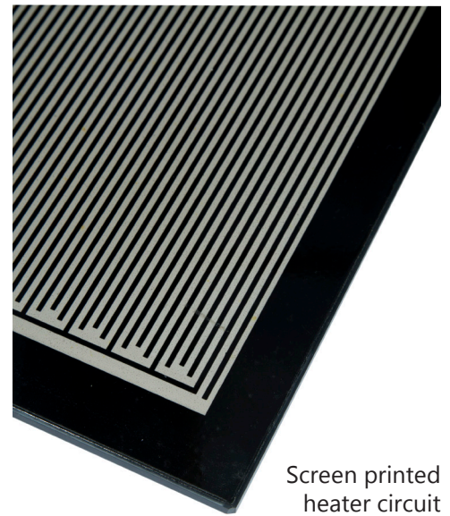
Screen printed heater circuit